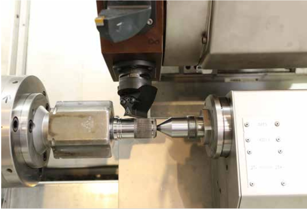
Twist-free rotation of the sealing ring running surface with the Y-axis