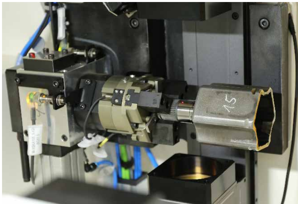
Optical measurement of the workpiece