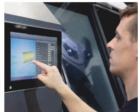
Easy on-site and remote operation

An intended chip conveyor can be placed under the automation so that no additional space beyond the machine dimensions is needed.